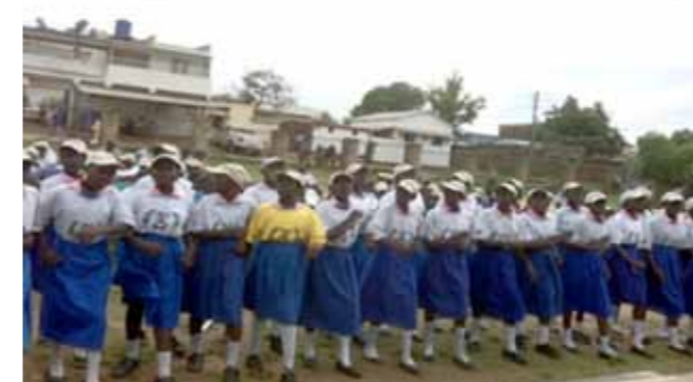
Pushed through, 2011 National Girls Education Act

Women Referral Hospital and Midwifery Training Center