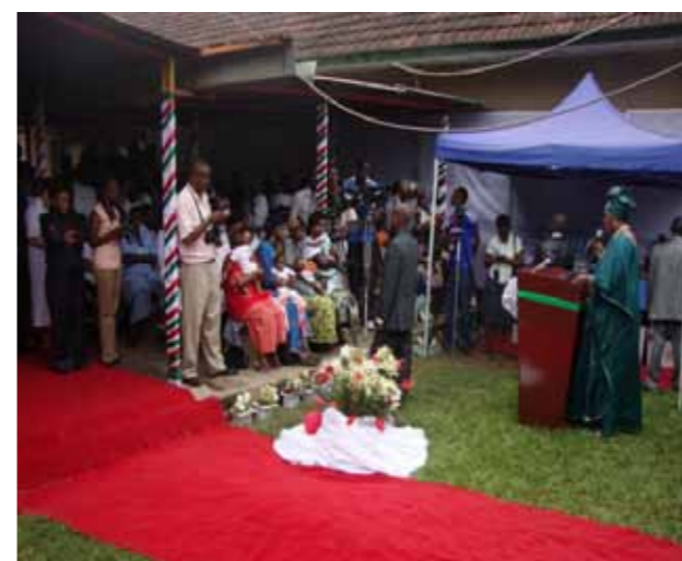
First Lady during the World AIDS Day 2011 at model PMTCT site