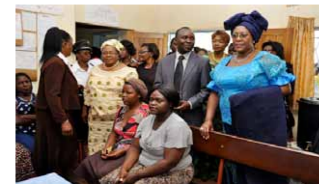
First Lady, Dr. Christine Kaseba meeting some of the women who came for cervical cancer screening during the OAFLA- Zambia PMTCT training workshop in Chongwe District.

Charity and benevolence: Charity for vulnerable and underserved individuals and families.