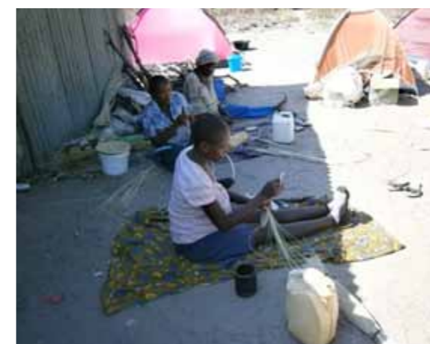
Pregnant women waiting to deliver

H.E Mrs. Penehupifo runs a project to support the construction and furnishing of maternal or birthing shelters. In Namibia, long distances to health facilities, especially in rural areas, is one of the three delays which are contributing factors to maternal and child mortality.