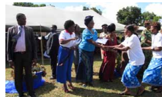
First Lady Dr Christine Kaseba Sata presenting certificates to graduates of the first OAFLA- Zambia, PMTCT Training Workshop for Lay Workers/ Counselors in Chongwe District

During the five days workshop, cervical cancer screening services were available for women in the surrounding community and more than 100 women were screened.