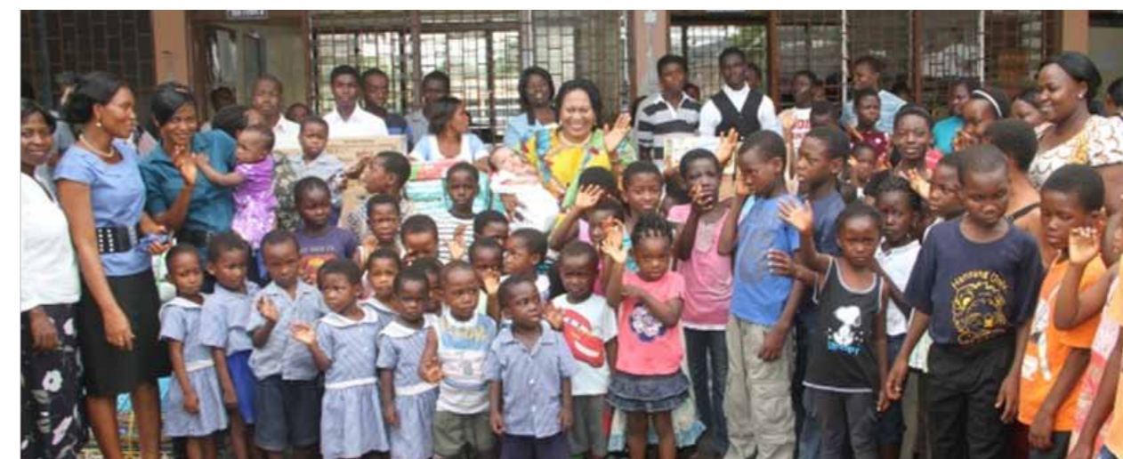
H.E. Mrs. Mahama on one of her usual visits to an orphanage

The "Lordina Foundation" has been designed to support and to create homes within orphanages in Ghana; a positive and reinforcing environment where children can be nurtured, grow, develop and attain their full potential. Eventually, the foundation will raise funds to provide vocational skills for the youth and grant scholarship to brilliant but needy and underprivileged children.