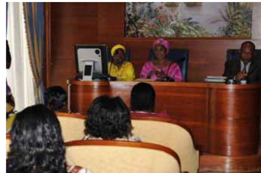
Meeting with women traders