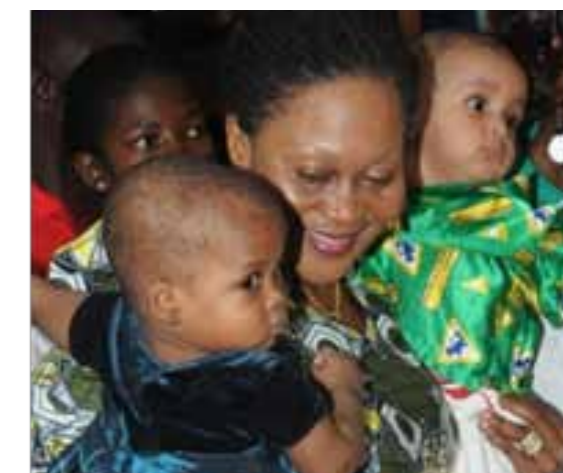
H.E Mrs Mahama cuddles the children at an orphanage she has been supporting for years