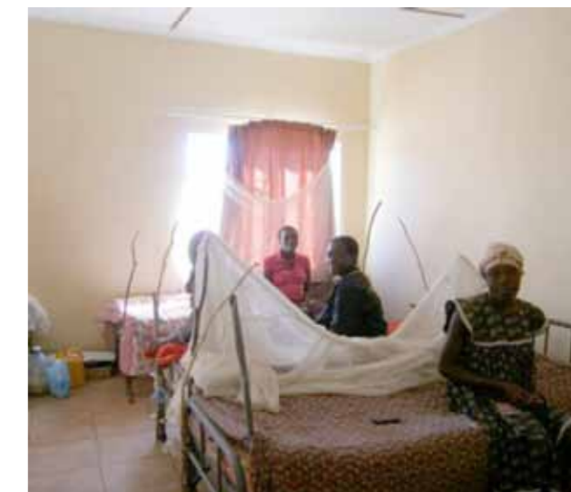
Renovated waiting shelter

H.E has supported the renovation and furnishing of two birthing shelters which were initiated by and built with active participation of the local communities.