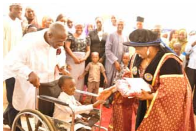
H.E Dame Patience Goodluck Jonathan presenting gift to one of the beneficiaries of Heart surgery program during the graduation ceremony of her NGO Training School

In December 2012, a batch of 12 children with heart ailments was flown abroad for heart surgery. This is in furtherance of Her Excellency's promotion of healthy family and healthy nation. When Her