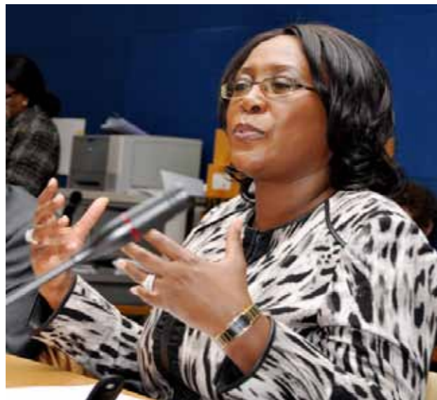
First Lady, Dr. Christine Kaseba speaking in her capacity as WHO Goodwill Ambassador on Gender Based Violence, during a High-Level panel discussion on the Magnitude of the Health Impacts and Health Sector response to Violence against women at the 57th Session of the Commission on the status of Women

Dr. Kaseba was recently appointed the WHO Goodwill Ambassador on Gender Based Violence and has since participated at the Commission on the Status of Women at the United Nations calling for the end to violence against women.